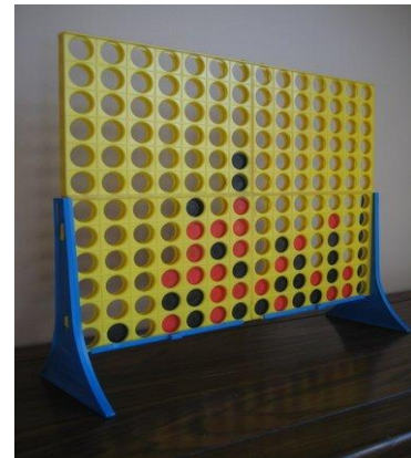
Figure 1. Traditional Connect Four game.

The common language, with which we could define the games, was a custom expression language made by our project leaders. Using it, we managed to develop a game called Connect Four. The goal of the game is to align four tokens in a line, by dropping them into a grid. The game is played by two players, each of which use differently-colored tokens.